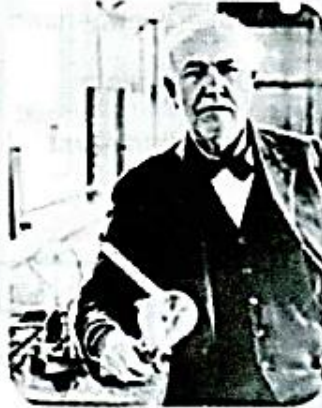
Thomas Edison Inventor of the light bulb Born in the U.S., 1847