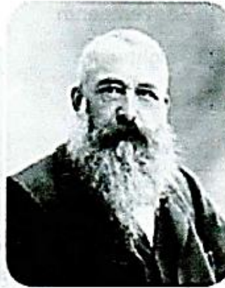
Claude Monet Painter Born in France, 1840