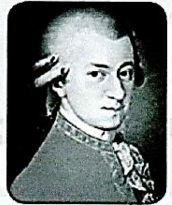
Wolfgang Amadeus Mozart Composer Born in Austria, 1756

a. Albert Einstein was a physicist . He was born in Germany in eighteen seventy-nine .